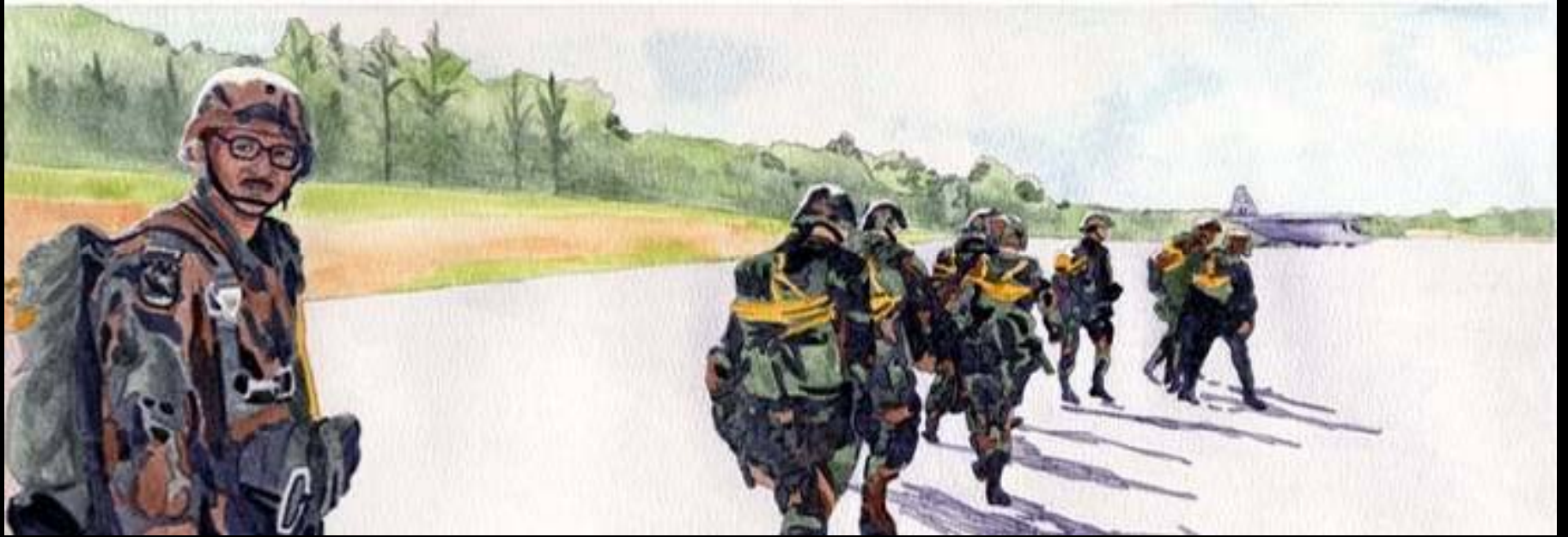
1 st Place “Always Airborne” by Patricia Covarrubias