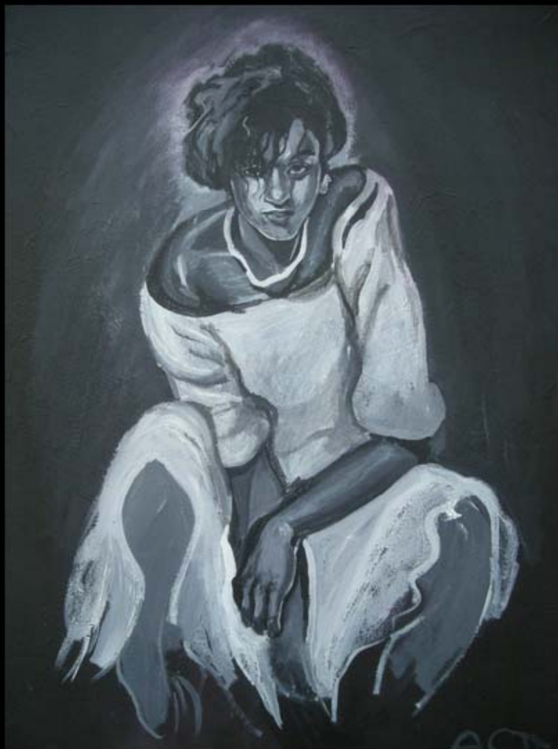
HM “White Dress” by SPC Alphonso Edwards II