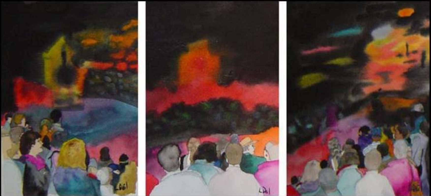
3 rd Place "Parade at Night" by Leslie Beale