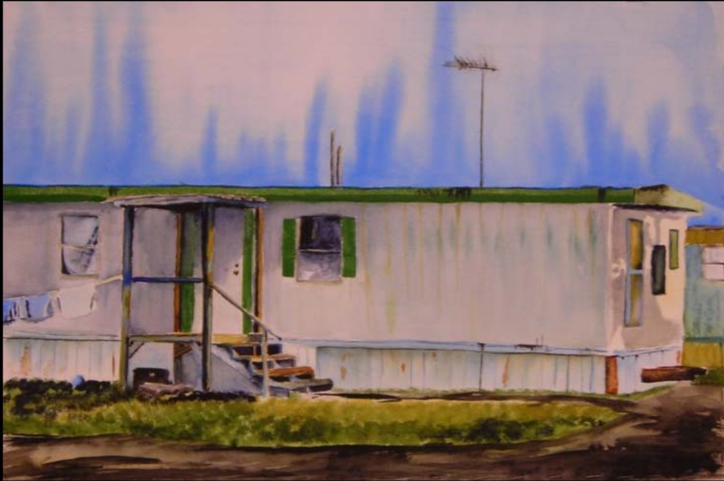
2 nd Place “Laundry Day” by SPC Joseph Brossier